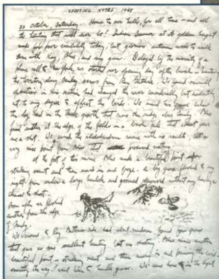
Shooting Notes, Oct. 20, 1945.